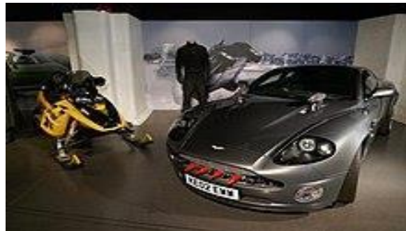
Aston Martin V12 Vanquish and Bombardier MX Rev Ski-Doo used in the film